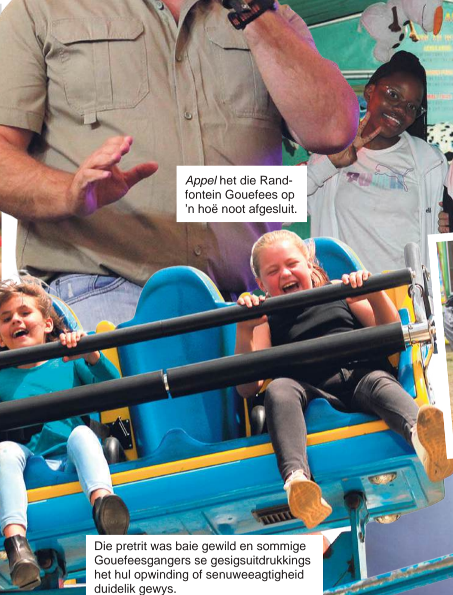
Appel het die Randfontein Gouefees op 'n hoë noot afgesluit.