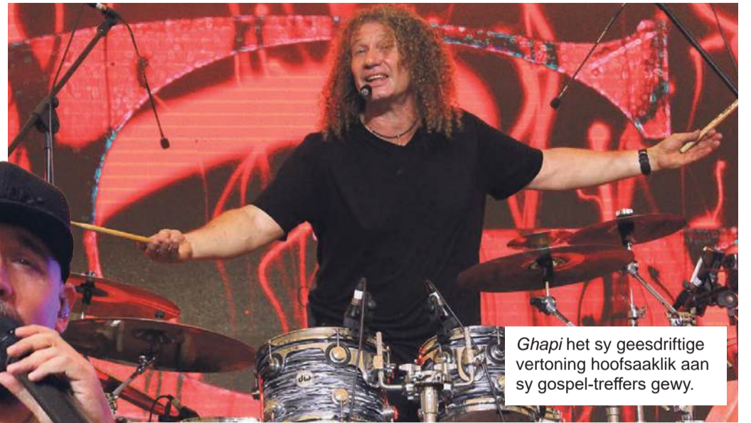
Ghapi het sy geesdriftige vertoning hoofsaaklik aan sy gospel-treffer gewy.