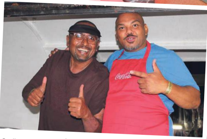
Stall operators ready to serve.