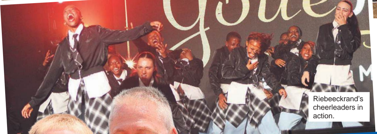
Riebeeckrand's cheerleaders in action.