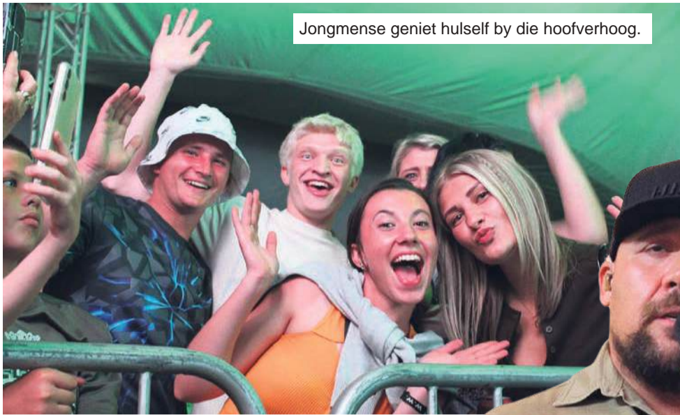
Jongmense geniet hulself by die hoofverhoog.